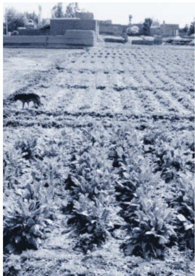
Spinach fields, wastewater irrigation

the wastewater stream is used for food processing, water quality must also meet potable water standards.