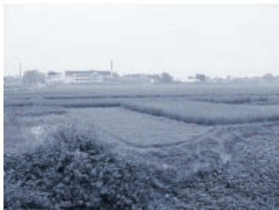
Wastewater irrigation fields, Hanoi, VietNam

It then discusses possible reuse applications, including irrigation, industrial use, groundwater recharge, and potable use. It describes a planning process for wastewater reuse and discusses public awareness and education programs. The Note concludes with discussions about the economics of wastewater reuse and some legal aspects.